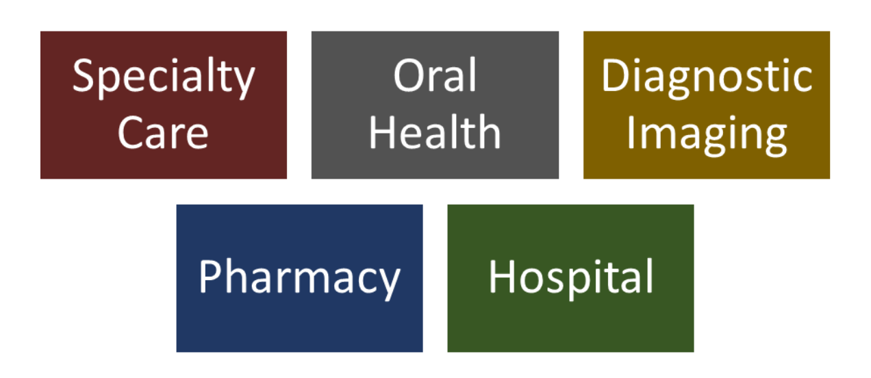
Figure 1: The five domains of primary care integration included in this report

were: 1) How integrated are community health centers with their surrounding medical neighborhood? and 2) What strategies have community health centers implemented to improve integration for their patients, in the interfaces between primary care-specialty care, primary care-oral health care, primary care-diagnostic imaging services, primary care-pharmacy services, and primary care-hospital care? (Figure 1). The primary care-behavioral health interface is covered in a separate report under this program.