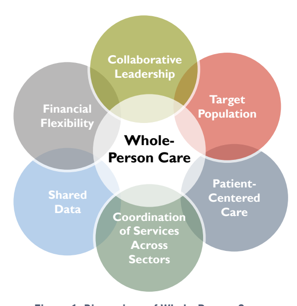
Figure 1. Dimensions of Whole-Person Care

With the support of BSCF and in collaboration with partners at California Association of Public Hospitals and Health Systems (CAPH) and the Safety-Net Institute (SNI), John Snow, Inc. (JSI) set out on a year-long endeavor to create a whole-person care framework and to understand the feasibility of implementing whole-person care in California. JSI reviewed national literature and spoke with thought leaders in California and other states, and conducted 36 individual and three group interviews between December 2013 and June 2014 with administrative leaders and providers from the health, behavioral health, and social service sectors in five California counties: Los Angeles, San Diego, San Mateo, Santa Clara, and Sonoma.